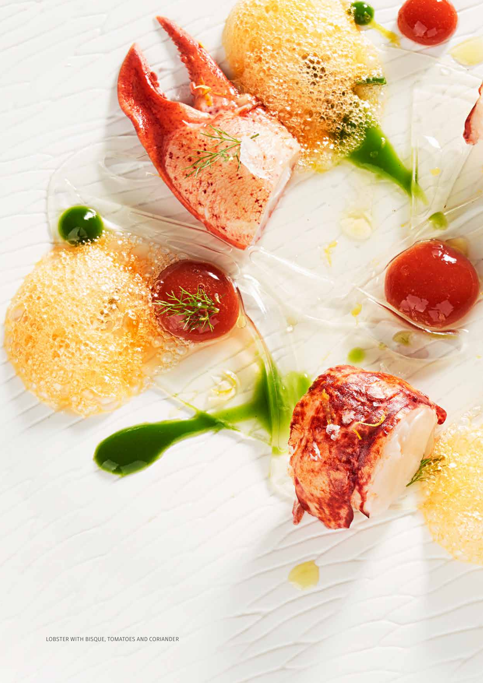
LOBSTER WITH BISQUE, TOMATOES AND CORIANDER