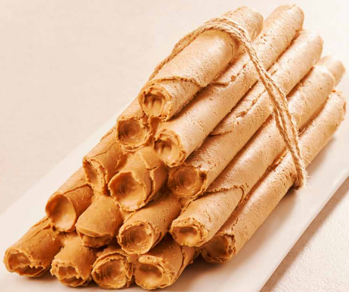
"NEULES" YULE LOG